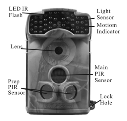
Figure 1.1: Front View of Ltl-5310M