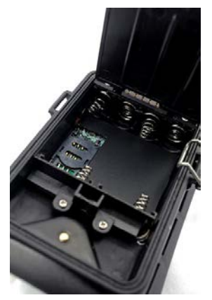
Figure 2-1 MMS-module Battery Box