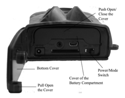
Figure 1.2: Bottom View of Ltl-5310M