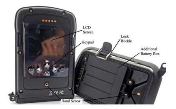
Figure 1.3: Back View of Ltl-5310M and Front View of Battery Box

To power up the camera, install four NEW high-performance alkaline or lithium AA batteries in the camera. FOR BETTER PERFORMANCE, WE RECOMMEND USING ENERGIZER LITHIUM AA BATTERIES. To achieve longer in-field life, always install the additional battery box which contains four more AA batteries. (Please reference Appendix III: Instruction on Installing Battery Box)